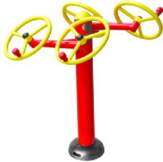
ST-T01X Taichi Spinner