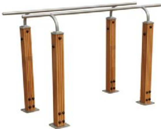
LK-S04 Wall Bars Combination