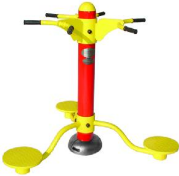
ST-Z05X Waist Twister