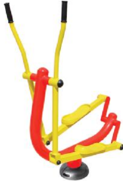
ST-T08X Elliptical Trainer