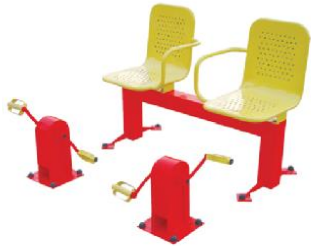
XB-X04A Lower Limbs Trainer