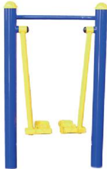
OK-M01C Air Walker (Single)