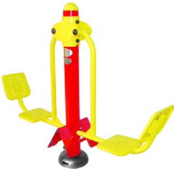
ST-Z01X Leg Press