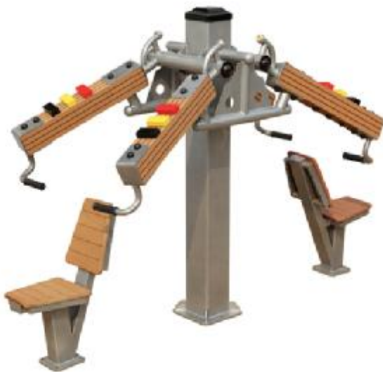
LK-S01 Seated Raised Trainer