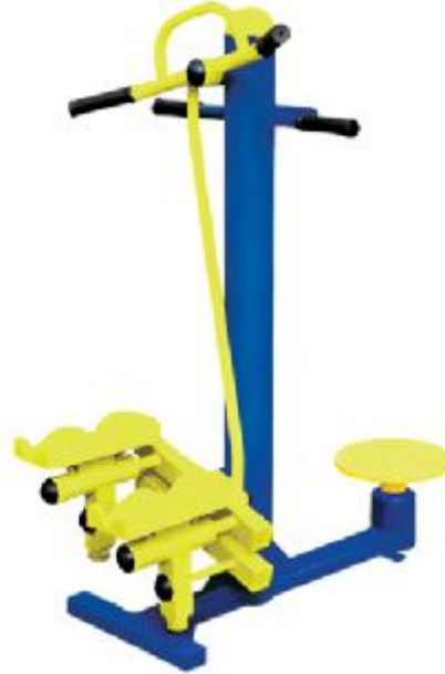
OK-N01 Stepper & Twister