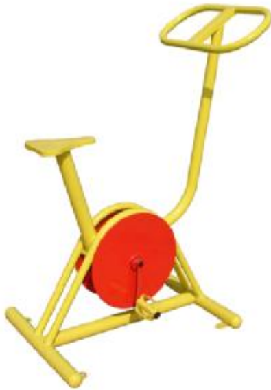
OK-Z08A Stationary Bike