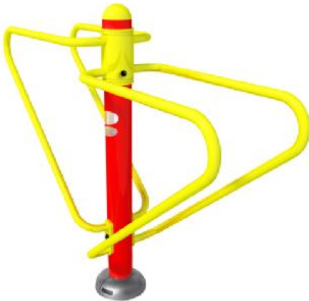
ST-S03X Dip / Leg Raise Bars