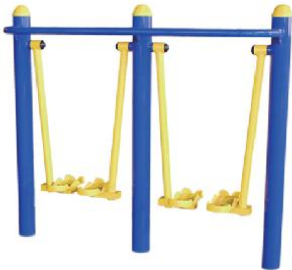
OK-M01D Air Walker (Double)