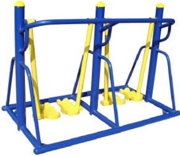
OK-M01A Air Walker (Double)