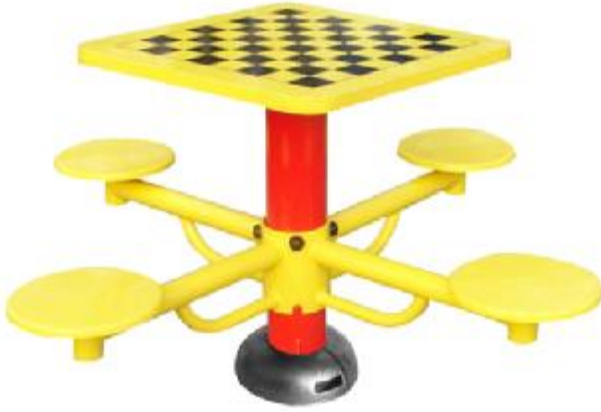
ST-Q02X Chess Desk