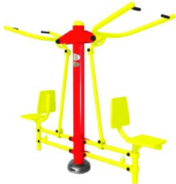
ST-Z04X Pull Down