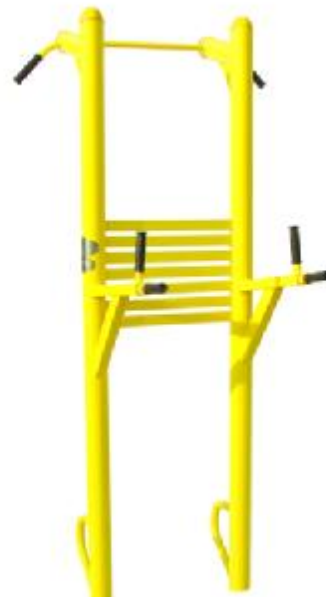
OK-D03 Multifunction Trainer