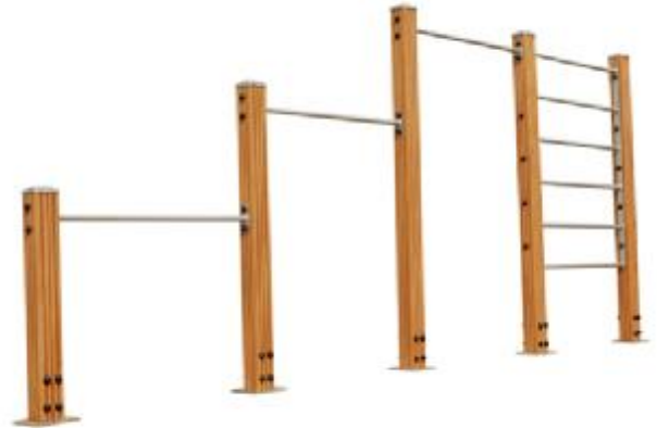
LK-L01 Wall Bars