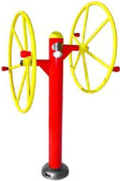
ST-J01X Rotating Wheel