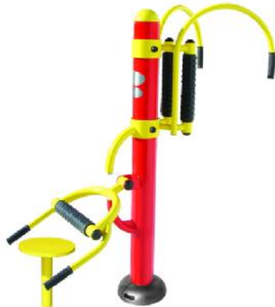
ST-A03X Massager(waist and back)