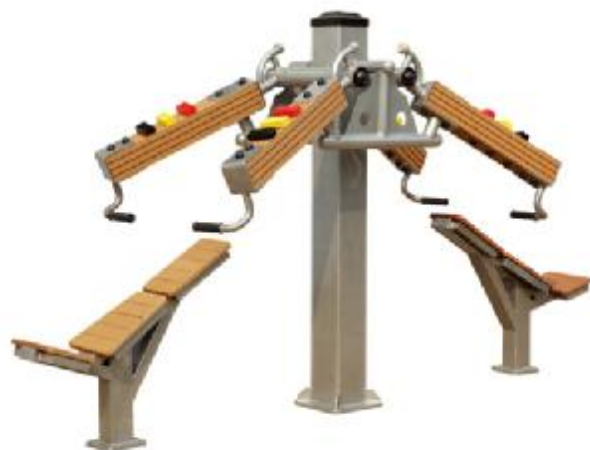
LK-S02 Recumbent Pushing Machine