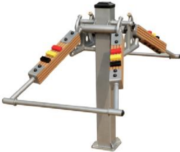
LK-S03 Weight Lifting Trainer