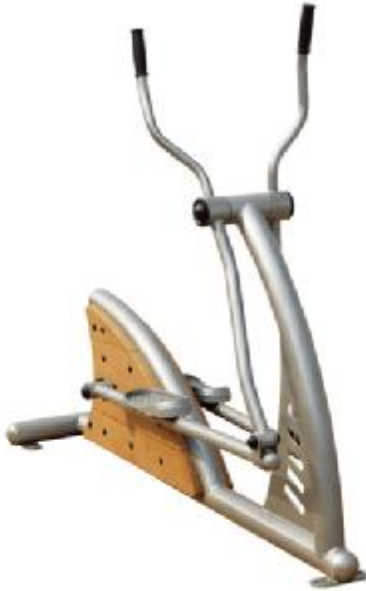
LK-T01 Elliptical Trainer