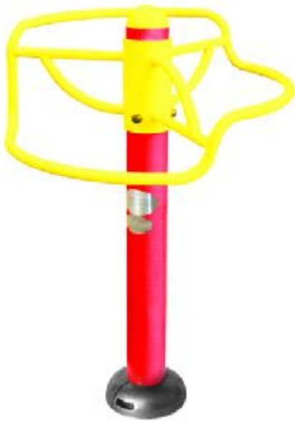
ST-Y02X Leg Stretcher