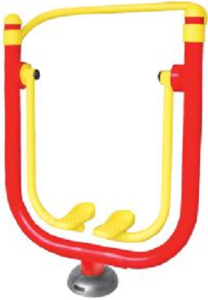
ST-M04X Air Walker