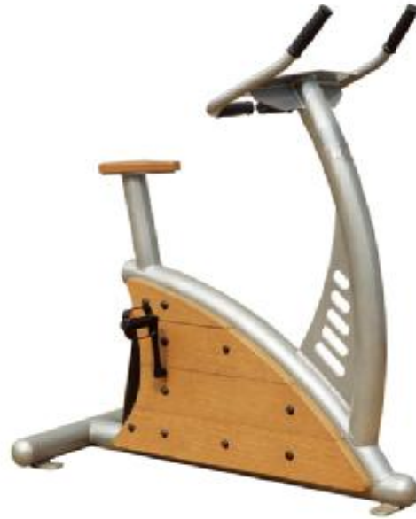
LK-Z01 Fitness Bike